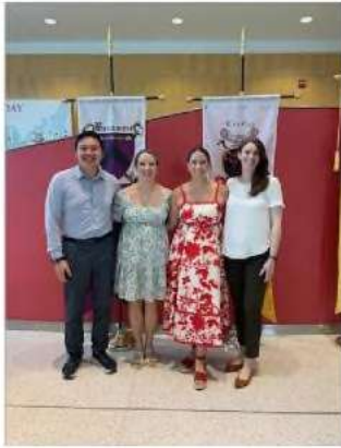
Class of 2024