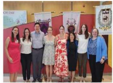
GME Graduation CMSRU Camden, NJ