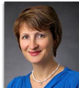
Female Pelvic Medicine and Reconstructive Surgeon Urogynecologist Program Director, Female Pelvic Medicine and Reconstructive Surgery Fellowship Program

This is a very deep question. I like medicine as a profession because you can be useful anywhere. It does not matter if you are in the USA or other country - somebody is always sick somewhere and you can use your skills to help. It makes me feel good about myself. I do not like mundane things: When practicing medicine turns into mechanical repetition of the same work and loses the creative component - that part I dislike. But it is up to me to minimize it in my work.